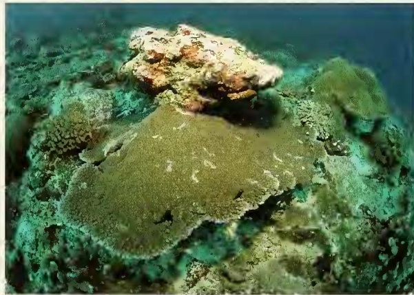
Figure 15. Overturned live Acropora sp. table at 10 m water depth at Pulau Rondo, October 29, 2005.

Acropora spp. tables, both alive (Fig. 15) and dead (Fig. 16a and b) and overturned Porites spp., but the majority of the reef was unaffected (Fig. 17). Live coral cover was 39%, although this figure was equalled by the proportion of rubble along the transect line.